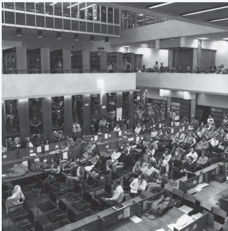
U of S Law Library c. 1978

The Centennial Student Enhancement Fund is an endowed fund that will provide much needed financial support to students at the College of Law through bursaries, scholarships and awards. It will also serve to enhance the student experience by supporting a variety of activities, including our moot teams, clinical experiences through Community Legal Assistance Services for Saskatoon Inner City (CLASSIC), as well as international student exchanges and internships. We have the set bar high—in order to reach our goal of $500,000, we are suggesting that each alumnus consider making a gift of $100 for every year that has passed since their graduation.