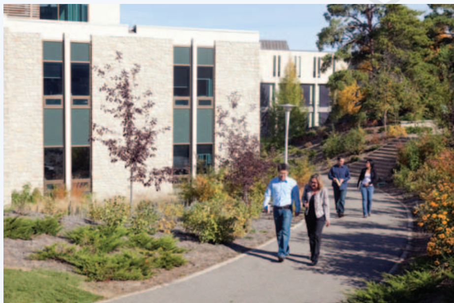
Take a walk down memory lane with former classmates, colleagues and friends.

There is no charge for attending activities at the College of Law during the day on Saturday, Oct. 6.