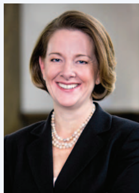
The Centennial Gala Evening will feature a special message from Premier of Alberta, Alison Redford, Q.C.

Tickets are $125 plus GST ($6.25) and processing fees ($8.75).