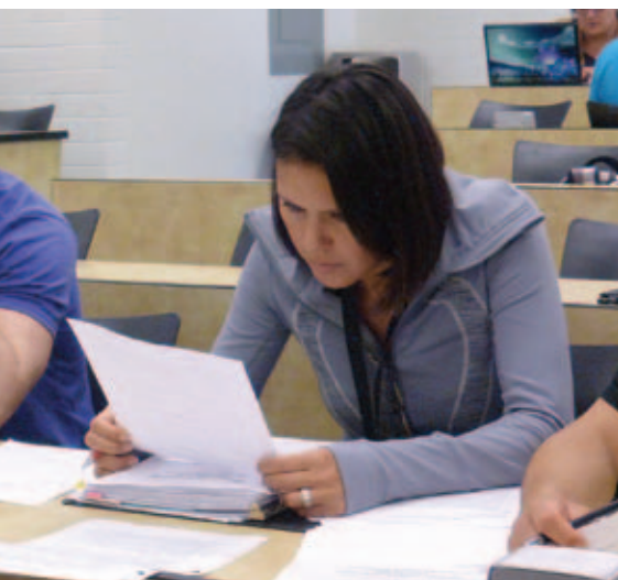
42 students enrolled in the 2012 Program of Legal Studies for Native People

Every spring, the Program of Legal Studies for Native People (PLSNP) offers a unique and exciting opportunity for Aboriginal people (First Nations, Métis, and Inuit) beginning their legal studies. This year on its 40th anniversary, the program welcomed 42 students from across Canada to the University of Saskatchewan campus.