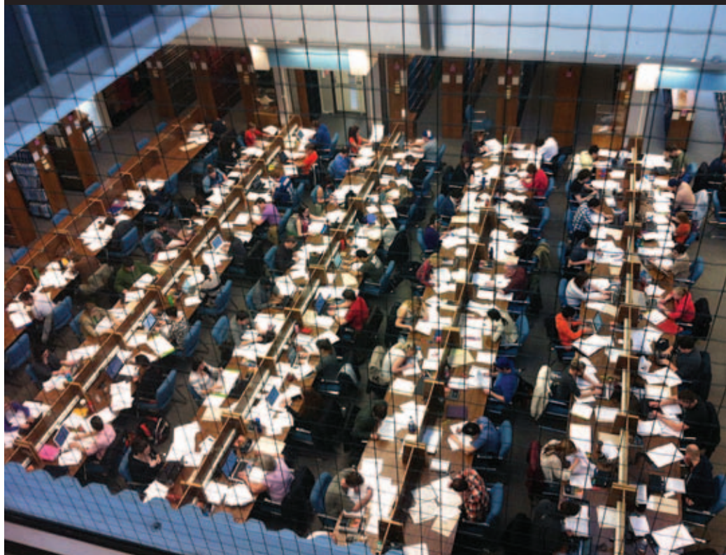
Students flood the law library during final exams in April

The college would like to acknowledge and thank Burnet, Duckworth & Palmer LLP (BD&P) for their generous contribution of $200,000 over 10 years to sponsor this ceremony.