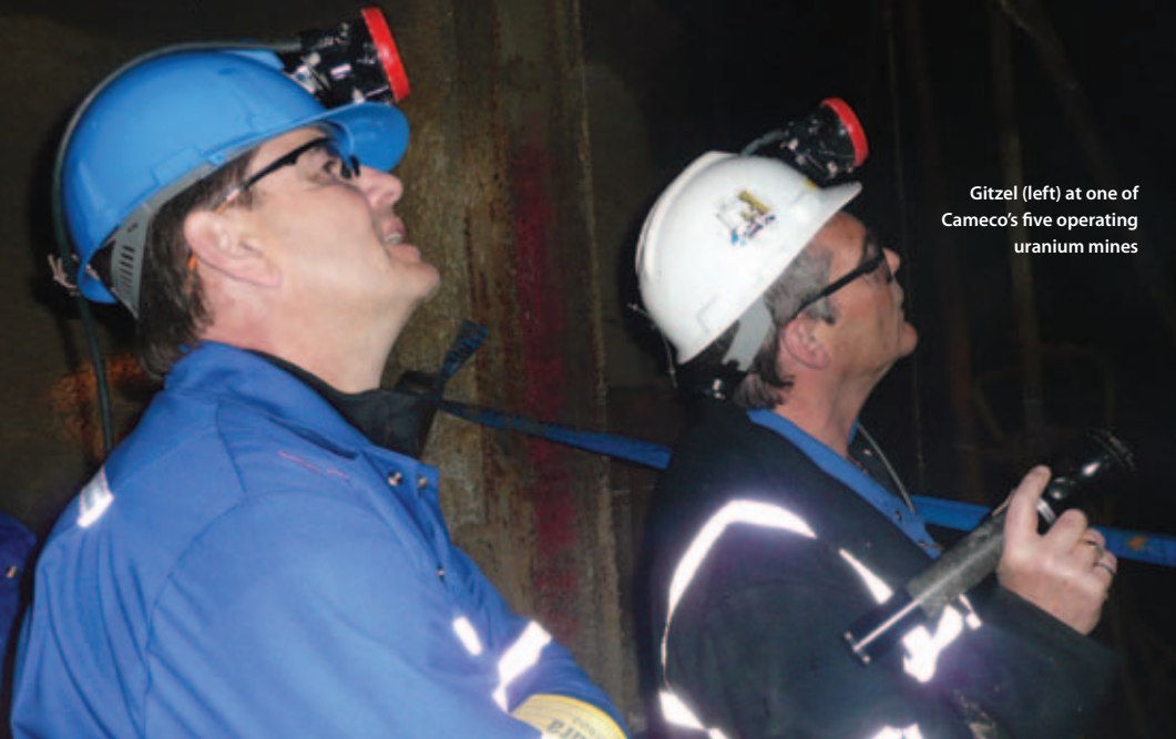
Gitzel (left) at one of Cameco's five operating uranium mines