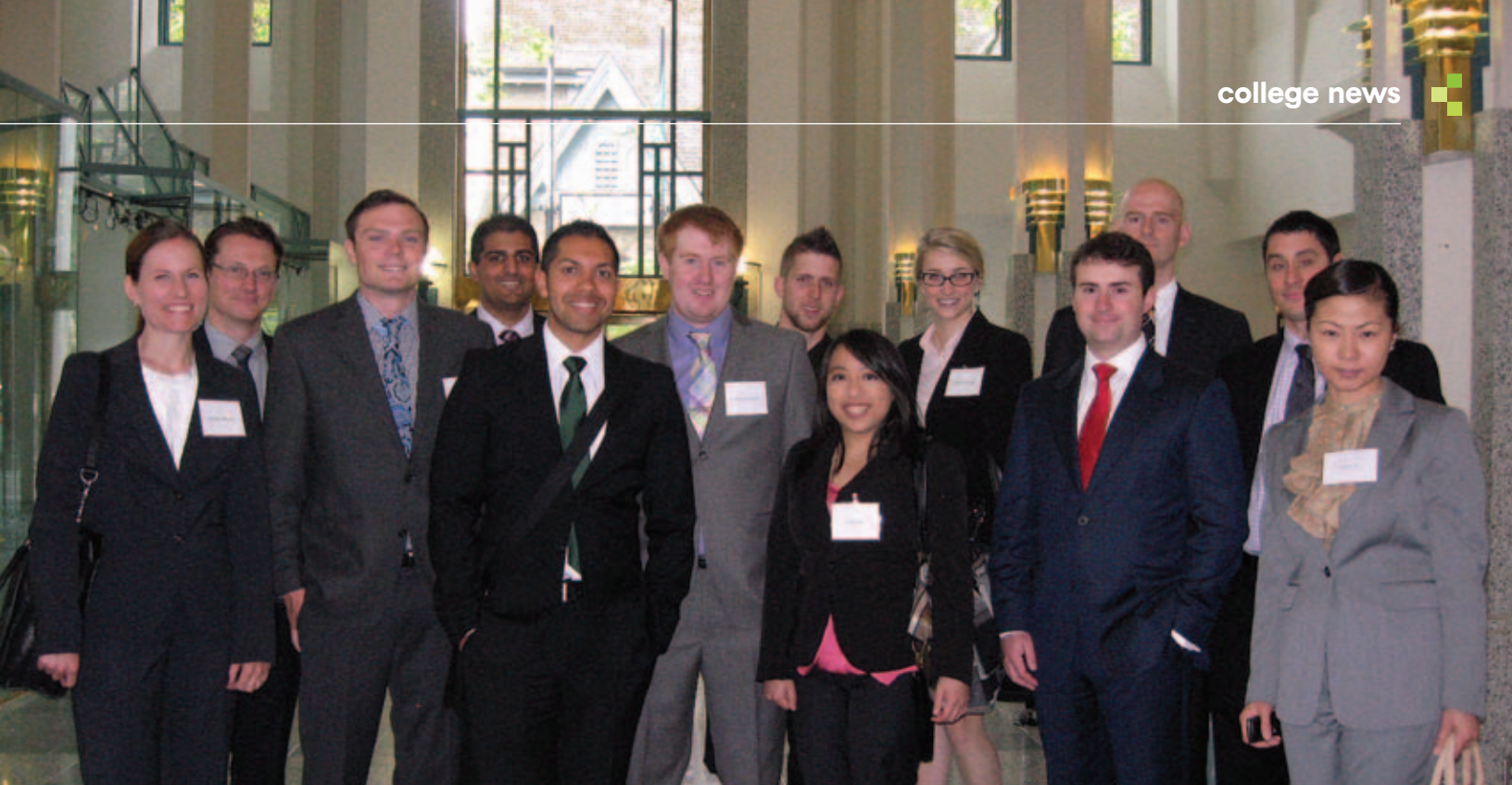
College of Law students pose for a photo during the firm visits in Vancouver on June 5-6.